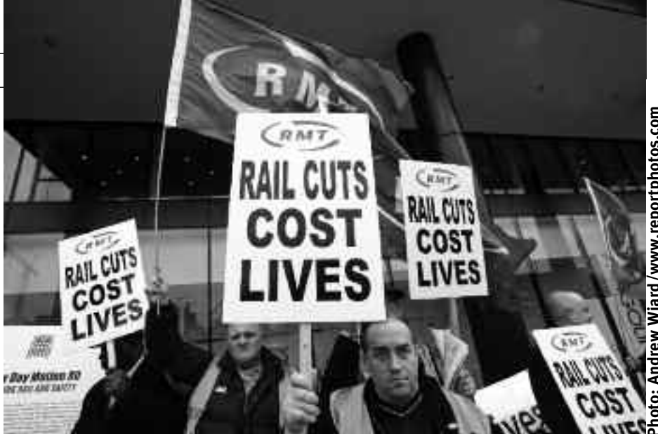
London, 12 March. RMT & TSSA trade union members demonstrate outside Network Rail headquarters over plans by the company to axe up to 1,500 safety-critical jobs and to tear up national agreements on working practices. Maintenance workers have voted to strike over the issue.

LONDON'S residents are paying for the 2012 Olympics, but won't get preference in the race for tickets as EU law bans "discrimination".