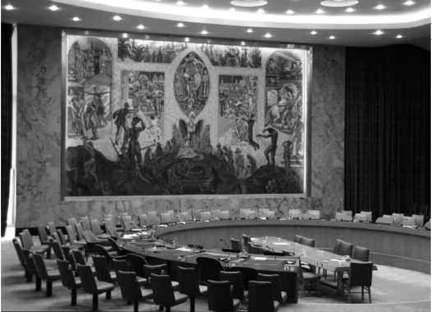
The chamber of the Security Council at the United Nations, New York.

unsustainable, because as they were aware the success of the colonial liberation movements would lead to new, often revolutionary members joining the UN and altering the balance of power with the imperialists.