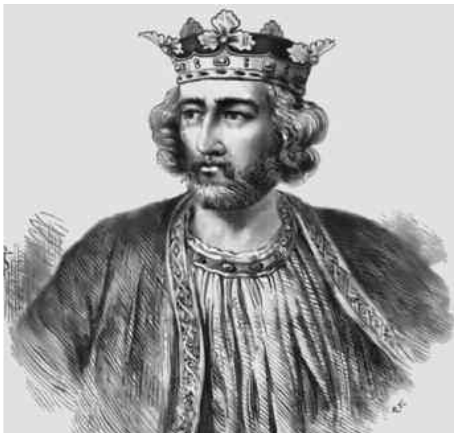
Edward I: started borrowing from Italian bankers.

Therefore, much of the Ricciardi capital was committed in various ventures. But as with today's inter-bank lending, they could look to other merchant societies for short-term