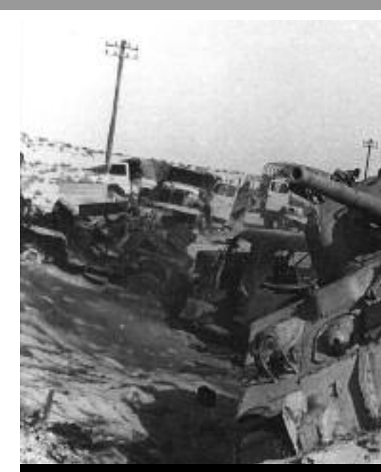
Knocked-out Israeli military vehicles, Sinai, 1956

Both Britain and France wanted Nasser removed from power, to stop his growing influence on colonies and protectorates. Both also were eager to ensure their oil supply route was kept