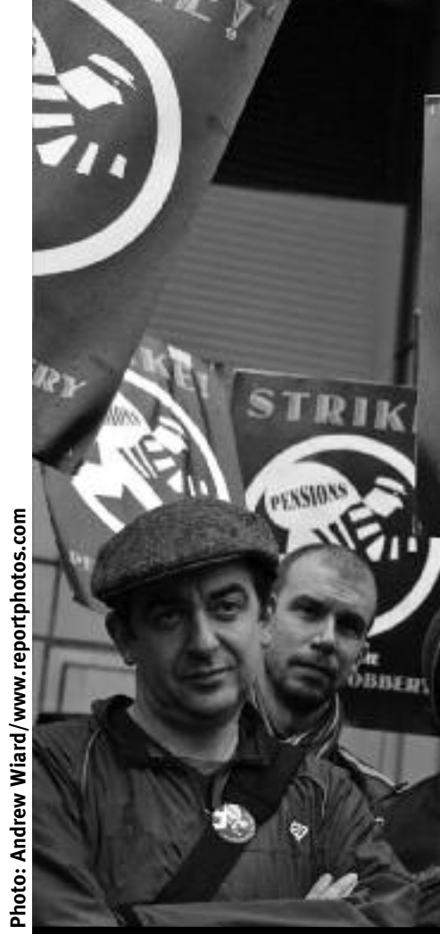
November 2010: NUJ pickets at BBC Televisio

So disarming comments regarding the "unforeseen consequences" of NEST that will appear in the press from the usual bunch of tame commentators should simply be ignored. Make no mistake: the