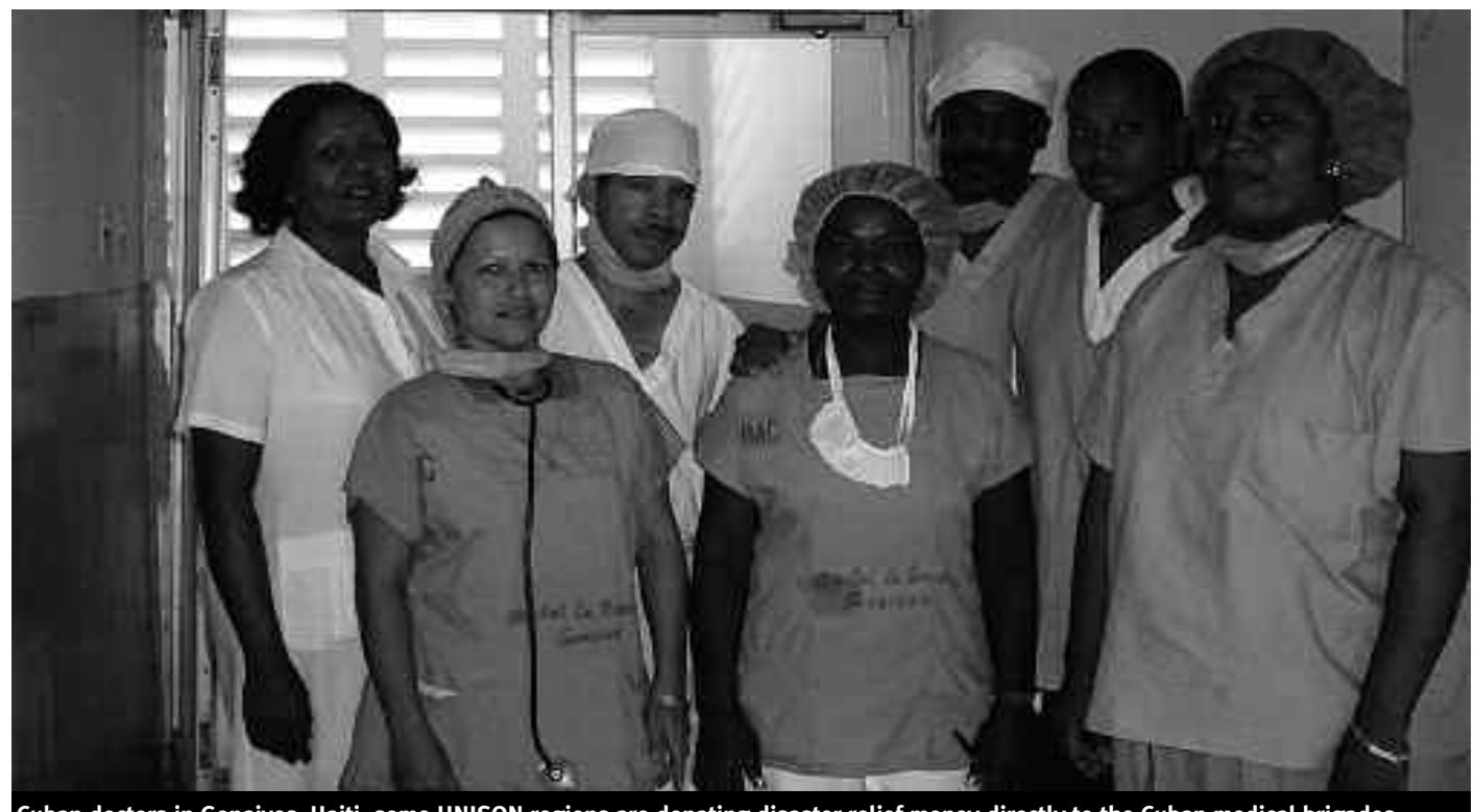
Cuban doctors in Gonaives, Haiti: some UNISON regions are donating disaster relief money directly to the Cuban medical brigades.

the CTC unions had genuine popular support. Despite this the ICFTU continued for years to undermine Cuba. It took a campaign amongst British unions to reverse TUC policy which was originally identical to that of the ICFTU.