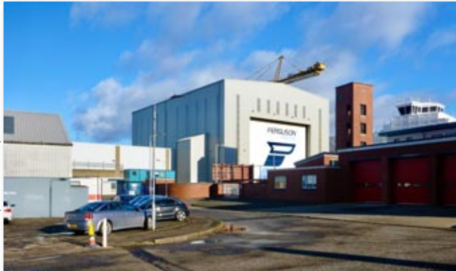
Ferguson Marine Engineering fabrication yard, Port Glasgow.

Ireland grows around 10,000 tonnes of chipping potatoes a year, but imports 80,000 tonnes from Britain. ■