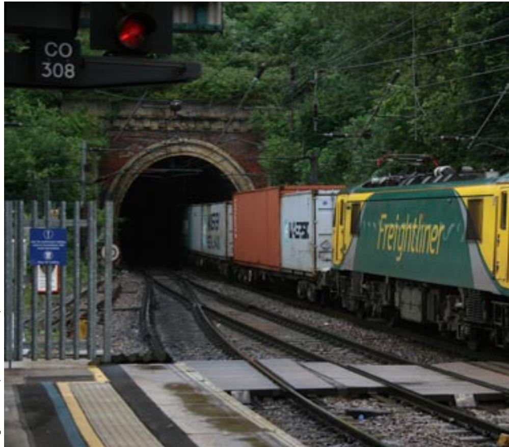
Roger Carvell (CC BY-SA 3.0)

This overwhelming reliance on road transport to keep the country functioning is a growing problem. All these goods vehicles contribute to increasing road congestion, which in itself means less efficiency and greater fuel consumption, leading to