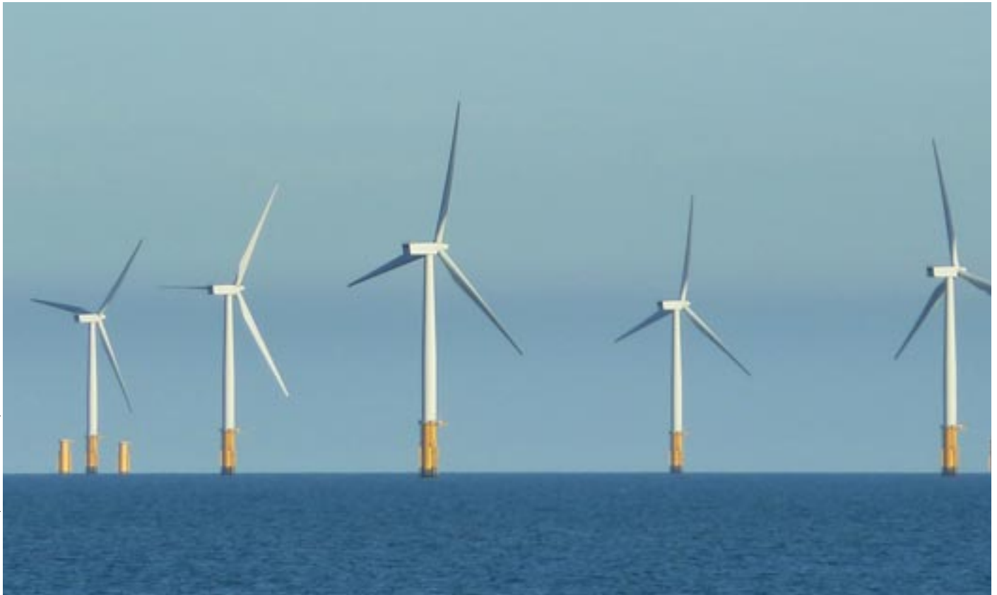
Rob Farrow (CC BY-SA 2.0)