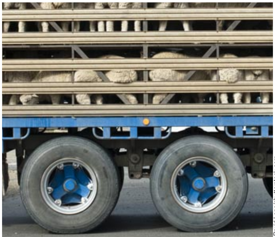
Out of the EU, Britain can finally ban the export of live animals.

'Member states had been bickering for years about CAP reform...'