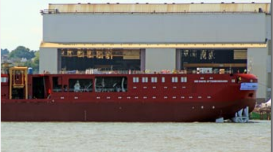
RRS Sir David Attenborough shortly after launch in 2018 at the Cammell Laird shipyard, Birkenhead.