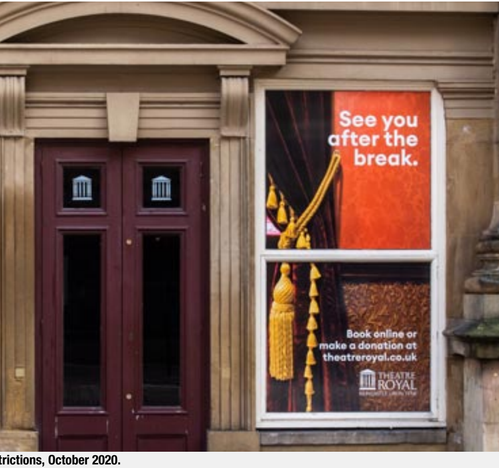
trictions, October 2020.

over cyberspace” and that actors participate “from the safety and comfort of their own home”. This will chime with what workers in other industries have been hearing from employers taking advantage of the government’s instruction to work from home.