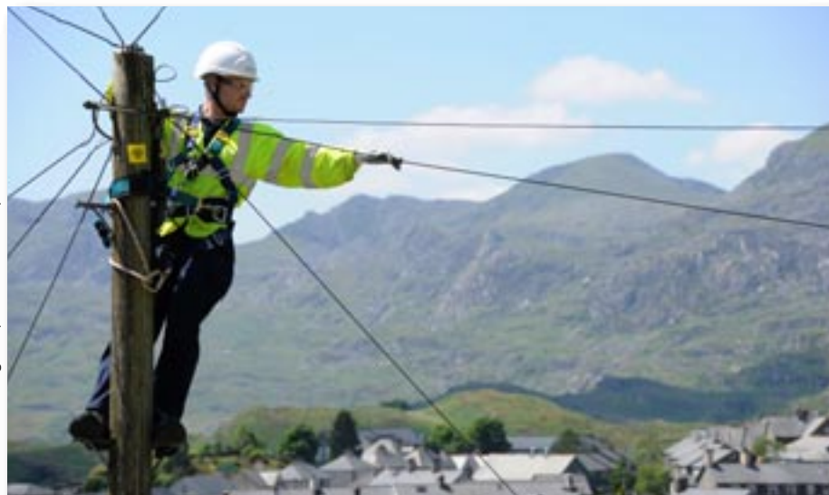
BT Openreach engineer working on Superfast Cymru in Mid Wales.