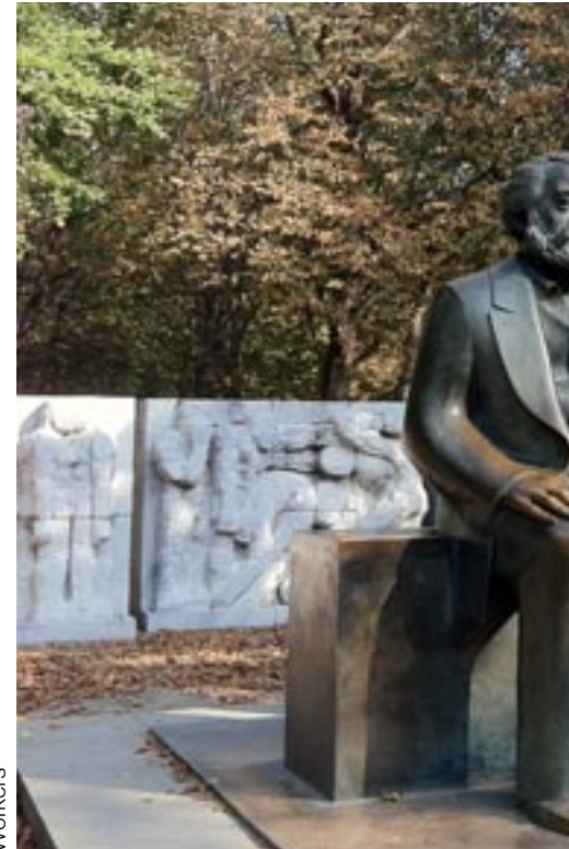
Statue of Friedrich Engels (right) with Karl Marx,

'Engels examined the economic laws driving capitalism and its cycles of boom and bust...'