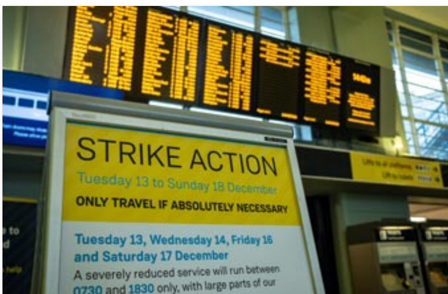
Sign at Richmond train station, Surrey.