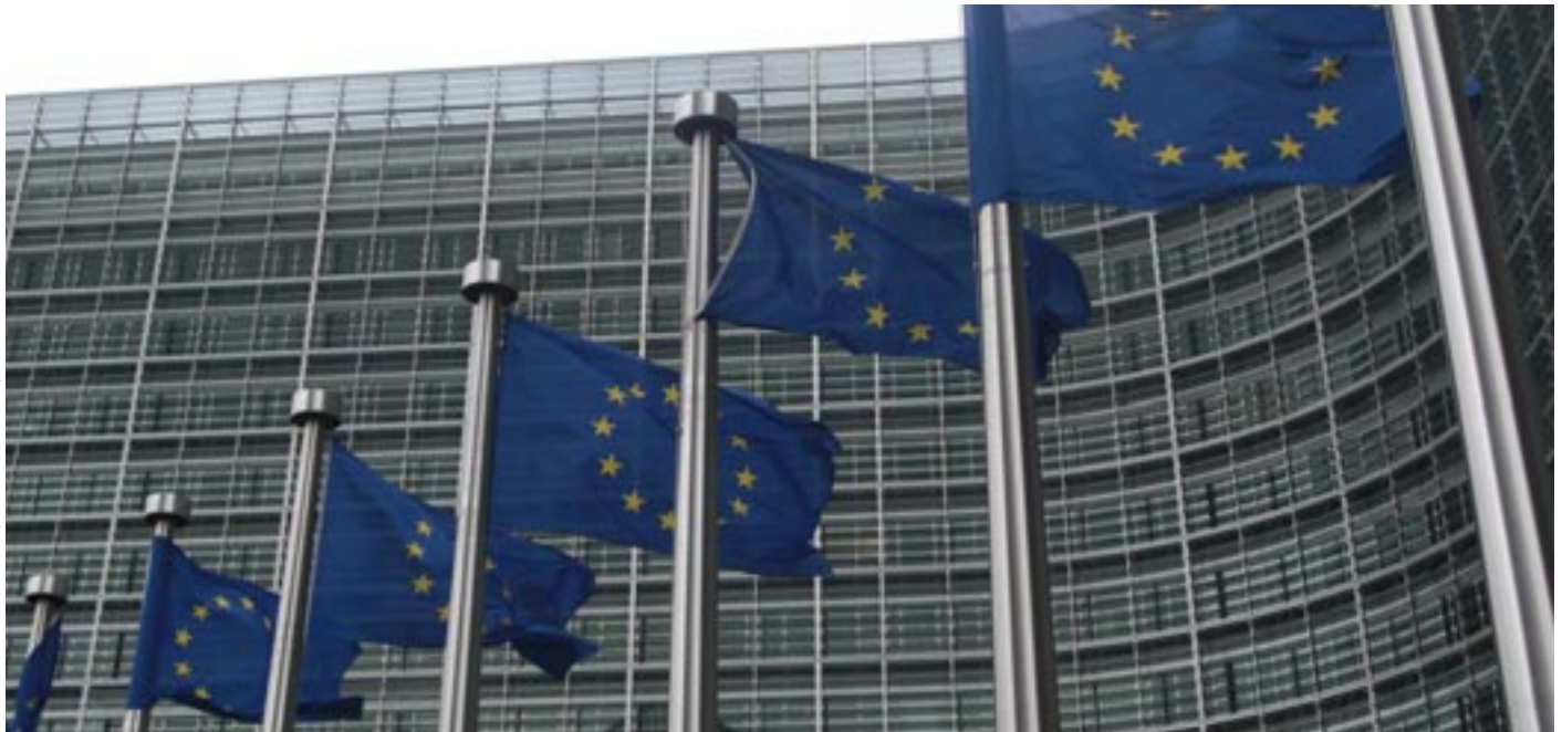
The European Commission, Brussels.

THE EU HAS been busy excluding Britain from as much research as it can, even under existing programmes which nominally should include British scientists. In November 2022 it even shut out British firms from participation in research on quantum technologies.