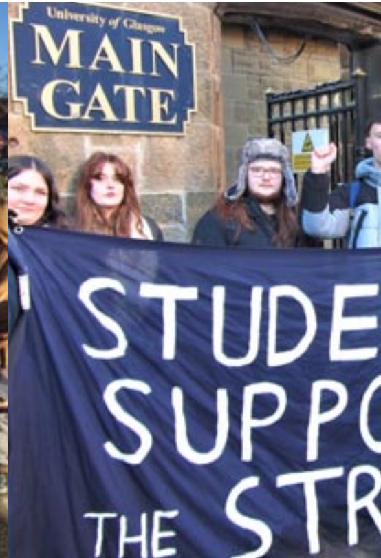
Clockwise from top left: nurses at Bradford Royal Infirmary; students show support for striking GMB members, Glasgow University; rail workers in Manchester; UCU rally, London; nurses at Great Ormond Street Hospital; postal workers, London.