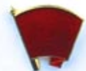
Red Flag badge, £1