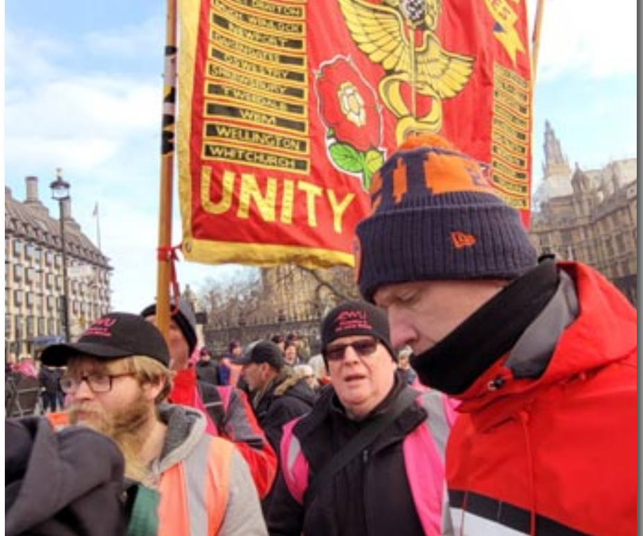
9 December: postal workers demonstrate in London as part of their pay fight.