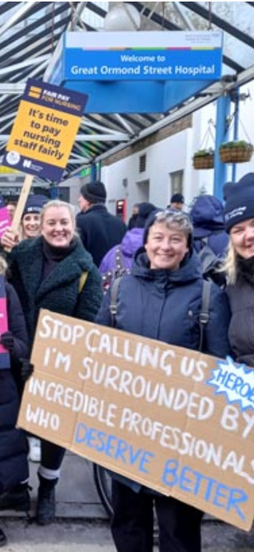
Great Ormond Street Hospital, London.

class going to respond to that threat? Unlike politicians, most workers at any time can be described as “essential”.