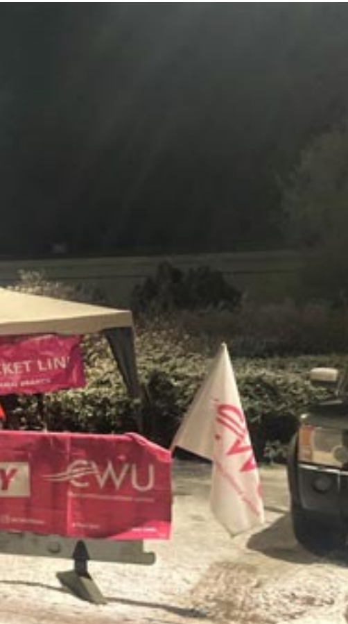
us 11 at Wishaw, near Glasgow.

second Scottish independence referendum has been diverted into social care funding. This means that plans for such a referendum to be held in 2023 have now been abandoned.