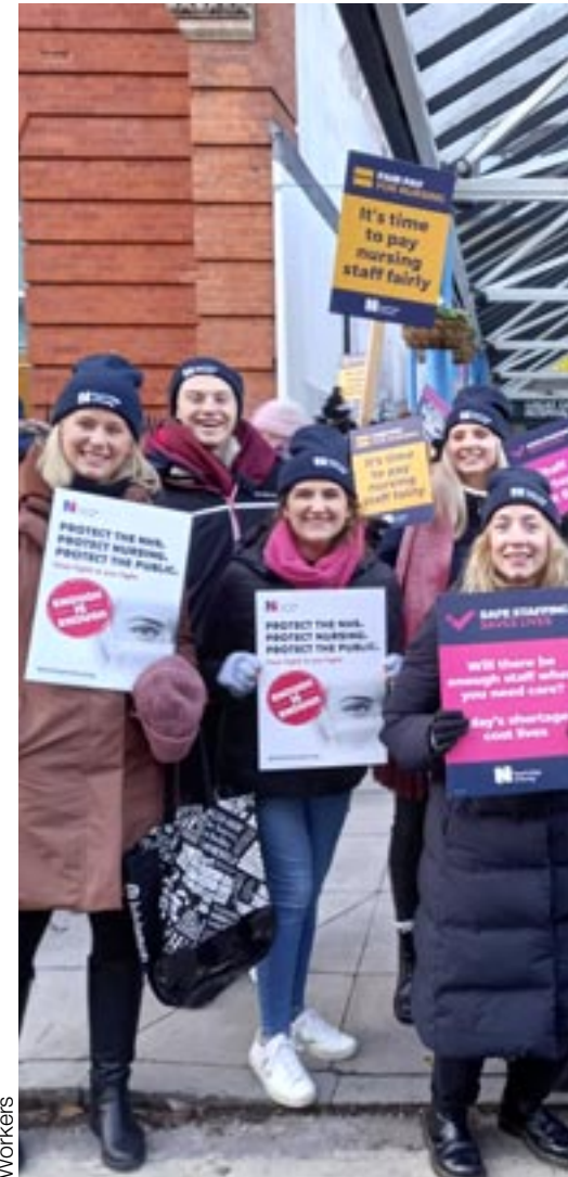
15 December 2022: nurses in high spirits outside

The solution cannot come from external support campaigns. Health care staff value public support, but as the general secretary of the Royal College of Nursing said in November 2022, "Gratitude is not enough – it doesn't pay the bills and it doesn't stop nursing staff leaving the profession..."