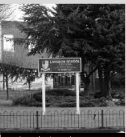
Langdon School, Newham.

Attempts to solve the problems by discussion and negotiation began in the previous academic year, but got nowhere owing to management intransigence. A first strike led to increased belligerence from the