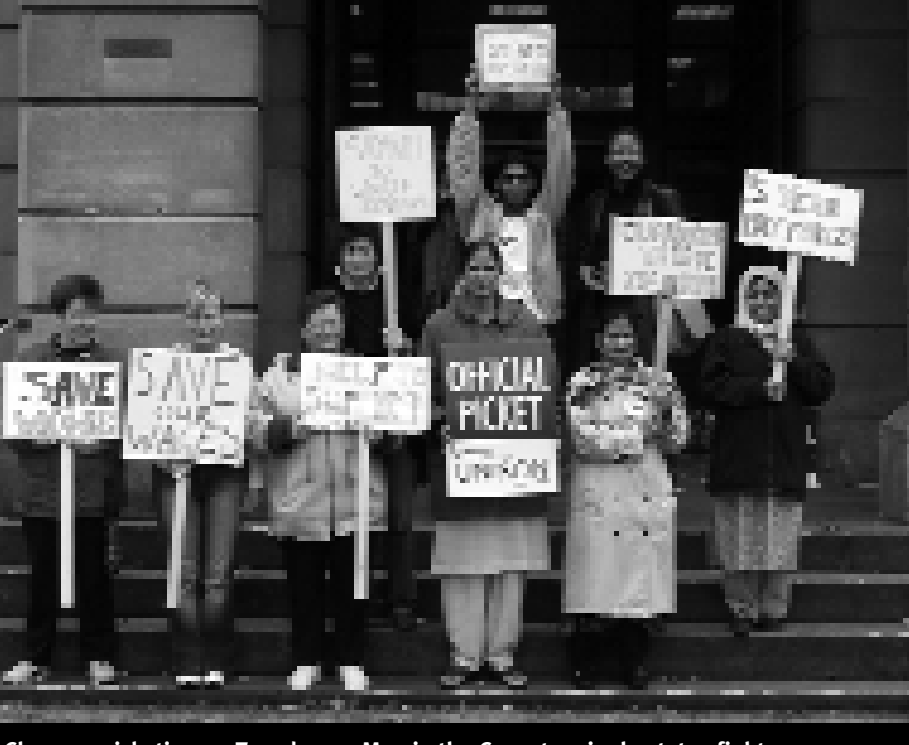
Cleaners picketing on Tuesday 24 May in the Coventry single status fight