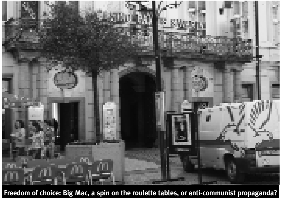
Freedom of choice: Big Mac, a spin on the roulette tables, or anti-communist propaganda?