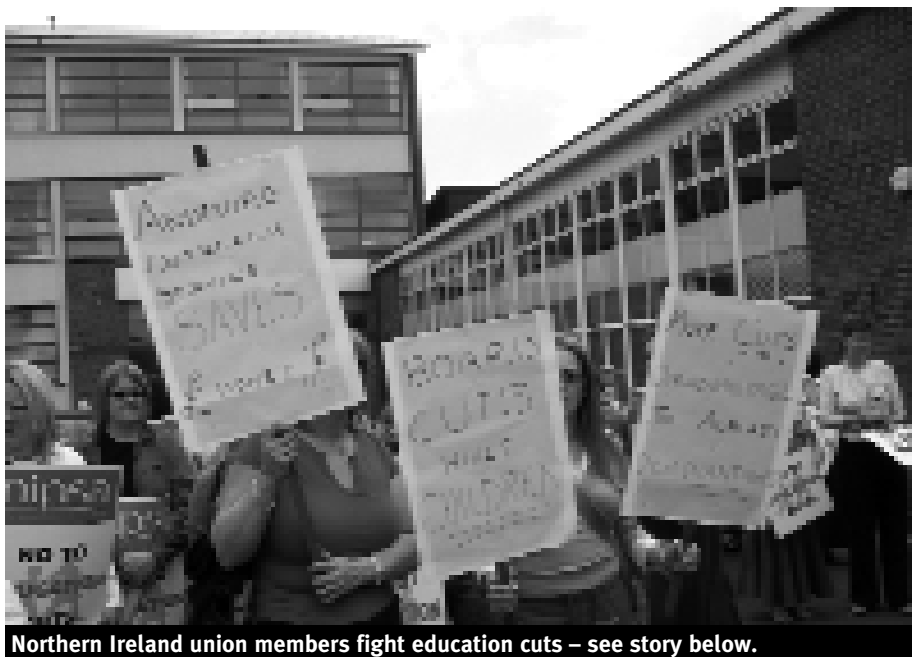
Northern Ireland union members fight education cuts – see story below.

So now you know, it was the EU that gave us texting and email! The popular response is that the proposal is more likely to help to sink the EU than any-thing else.