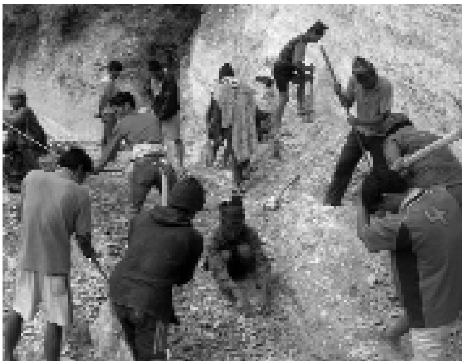
Workers on the Martyrs Road who have taken up tools in their own hands where no government or outside force has ever helped them.

This article is an edited and shortened version of the Report from the Second International Road Building Brigade to Nepal (Britain and Ireland representatives).