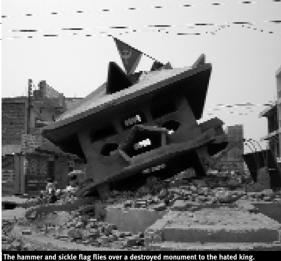
The hammer and sickle flag flies over a destroyed monument to the hated king.

As for the frequent accusations by western media that the road-building