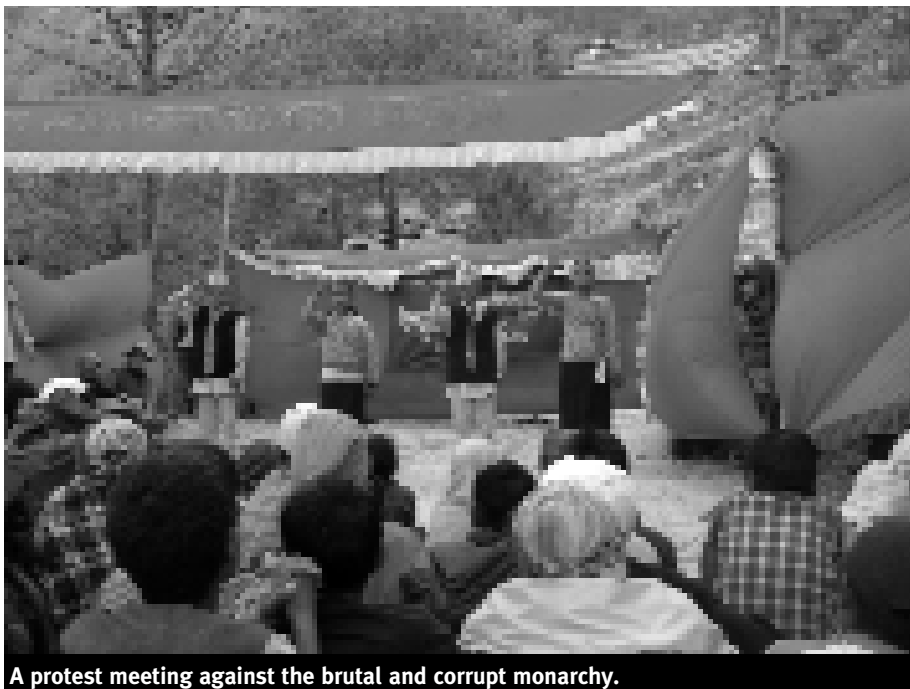
A protest meeting against the brutal and corrupt monarchy.

In the short time that we were there, we spent much time in the company of these two men. Out on the Martyrs Road itself, at the group's welcoming ceremony, each member had a mark, or tika, symbolising the blood of the martyrs, put