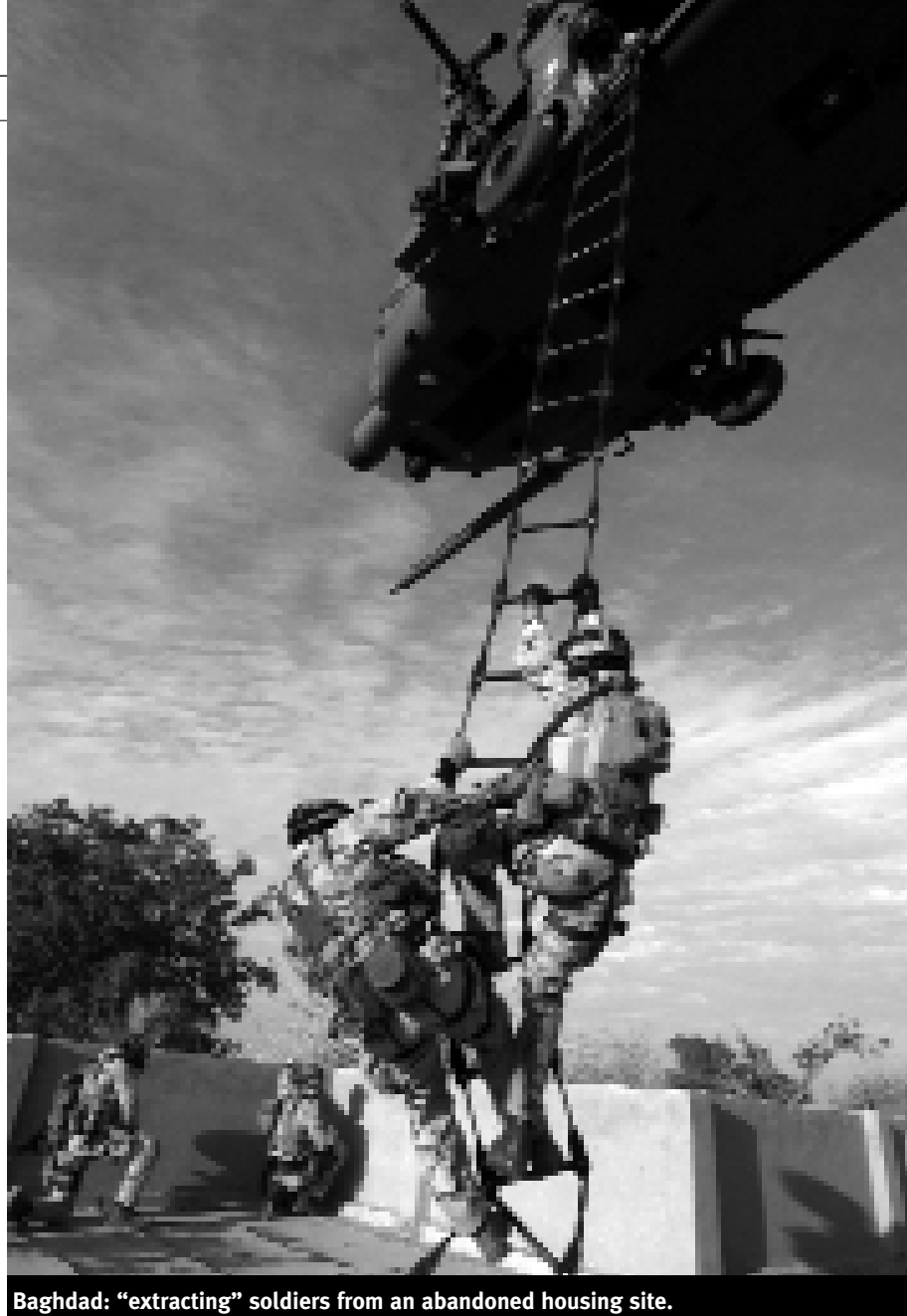
Baghdad: "extracting" soldiers from an abandoned housing site.

A third of all primary schools have no water supplies and half have no sanitation. Since May 2003, bombing has damaged 700 more primary schools. A UN study last