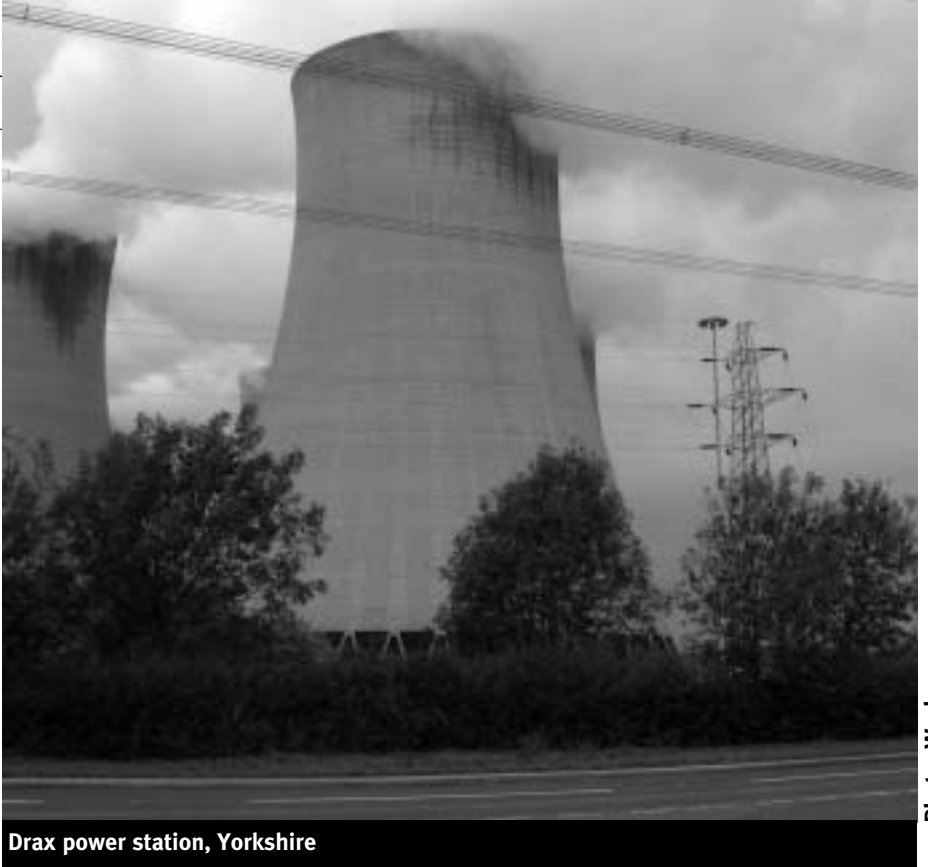
Drax power station, Yorkshire

TREASURY Minister Kitty Ussher told a City audience that the Brown government will lead the fight against growing calls for a crackdown on executive pay and bonuses. She said that pay and bonuses are not a matter for governments. Her comments are intended to highlight the Brown government's position as a free-market champion in Europe.