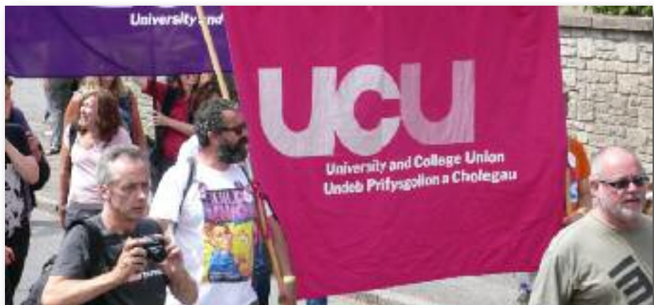
Academics marching under the UCU banner at last year's Tolpuddle Festival.