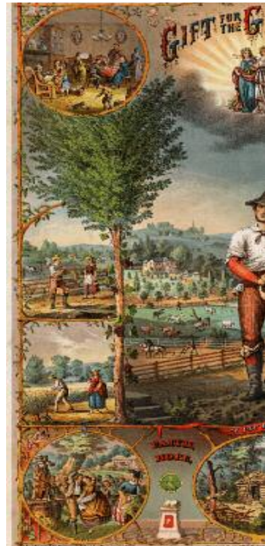
Promotional poster for the Grangers from around 1880

Despite Bryan’s oratory and a famous whistle-stop campaign, he lost to William McKinley. The economy was turning from bust to boom, and farm prices were slowly rising. The discovery of gold in California and Alaska ended its scarcity, lowering the