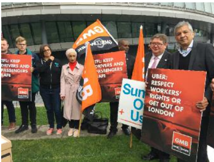
Sum of Us (CC-BY-SA 2.0)

‘All these models institutionalise exploitation.’