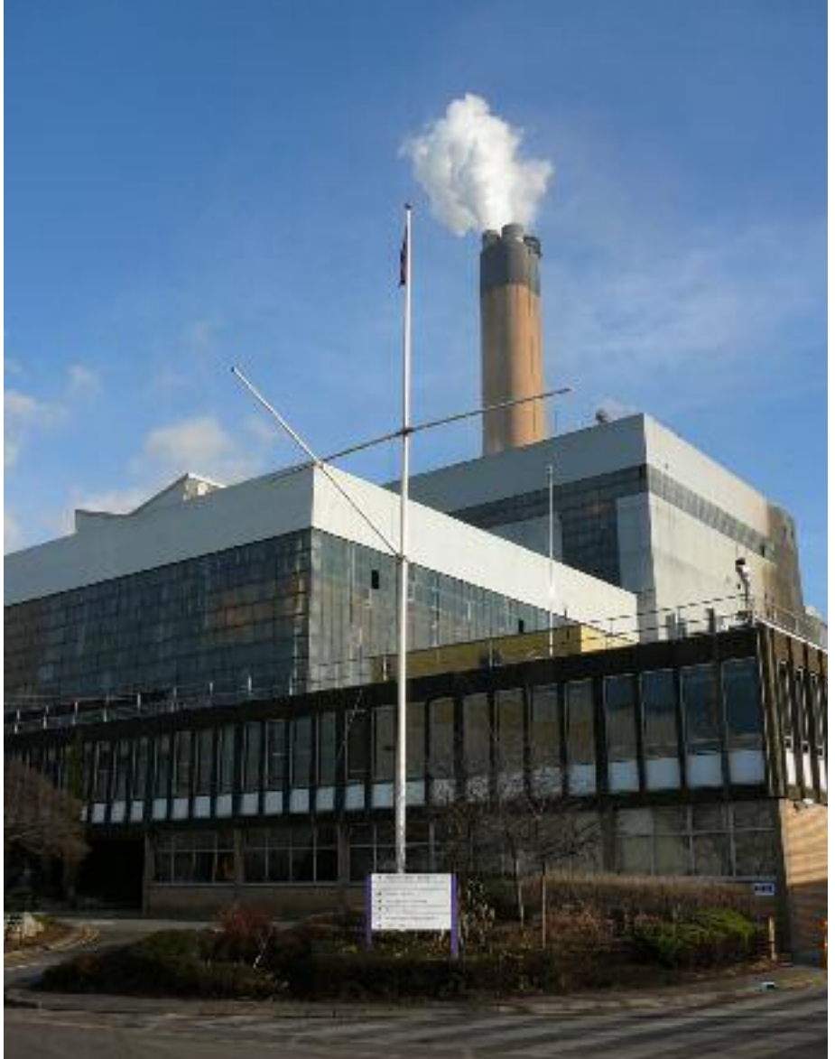
Eggborough power station, Yorkshire, the latest victim of the EU's impact on Britain. On 2 February it was announced that it will close after its last contract ends in September.

Closure of a steel works does not mean we stop needing steel. It simply means we must get it from somewhere else, and we have lost direct control over quality and