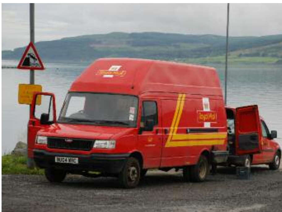
Royal Mail vans on Mull. EU competition laws have driven up prices in the postal industry.

"Concentrate on improving education, health, transport and energy..."