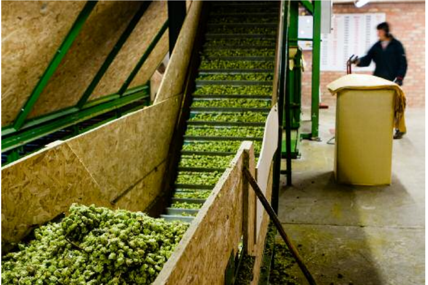
Sorting English hops, ready for drying and packaging for the brewing industry.