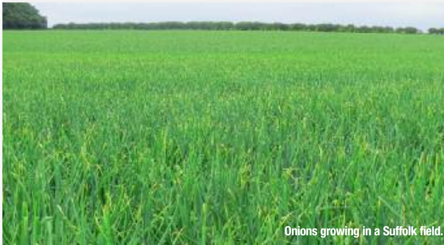
Onions growing in a Suffolk field.