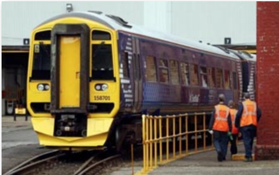
Train leaving the Caley yard in Springburn, Glasgow.

Switzerland is Britain's seventh-largest export market. ■