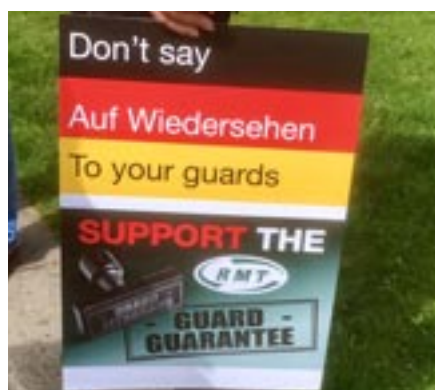
Left: Northern Rail is actually owned by German state company Deutsche Bahn!