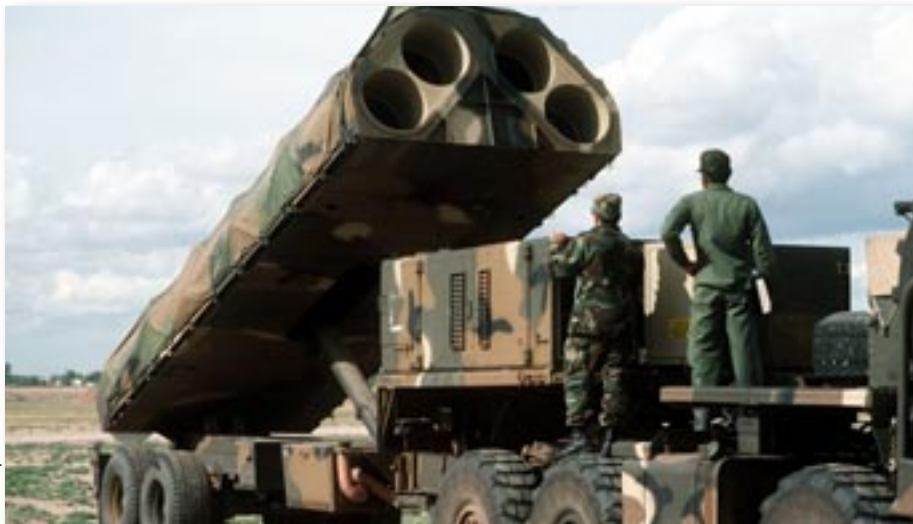
US Department of Defense