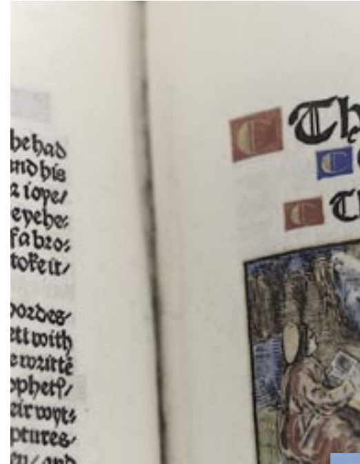
Right: Tyndale's Monument overlooking his birthplace in Gloucestershire – "in grateful remembrance". Above, the Gospel of St John in Tyndale's 1526 Bible, now in the British Library.

In 1536 Tyndale was finally captured by the agents of the Holy Roman Empire, taken to Belgium and burnt at the stake, but not before he had translated the New Testament and a good part of the Old. These later became the basis of the King James, "Authorised", Version of the Bible.