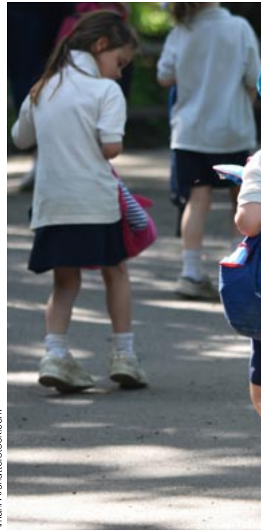
Infants on a field trip in Eastleigh, Hampshire. "Ev

Leadership salaries in academies have reached such eye-watering levels that even education secretary Damian Hinds had to comment. This diversion of resources has resulted in the widespread sacking of support staff employed to meet maintenance