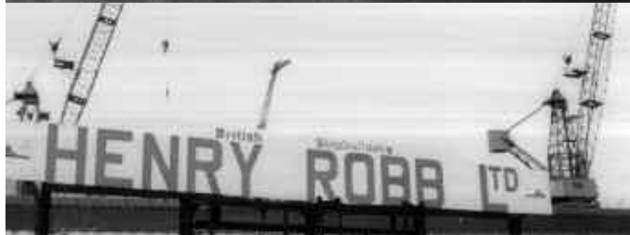
A history of industry and working class struggle (from top): factory occupation at Plessey, Bathgate, 1982; protest against school closures, City Chambers, George Square, Glasgow, 1993; fishing fleet, Mull; Robb Shipyard, 1981.

A MAJOR PRIZE FOR THE European Union in its quest to kill nation states and create a Europe of regions would be the first ever secession of a major portion of one of its member states. Yes, it's Britain – on course for this treatment as the Labour "war" Party gives up the ghost and connives with separatists who pledge to ballot for Scottish independence on winning a sufficient mandate at the next Holyrood elections for the devolved Parliament in May 2007.