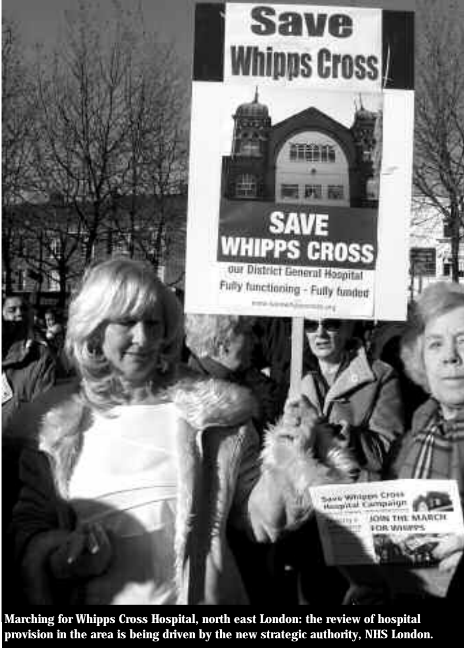
Marching for Whipps Cross Hospital, north east London: the review of hospital provision in the area is being driven by the new strategic authority, NHS London.

losses and the reorganisation which is causing them are symptomatic of a new kind of NHS.