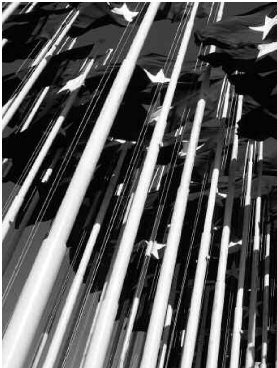
Black flags in Havana: the flags, in Anti-Imperialism Park opposite the US Interest Section, obscure the US's electronic billboard propaganda.

All this is being done without the knowledge of most national parliaments