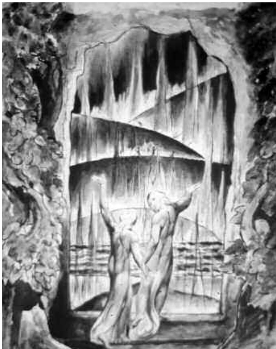
Blake's hellfire and damnation: attempts are now being made to drag thought backwards

He demolishes the Bible – “a chaotically cobbled together anthology of disjointed documents” – pointing out that Christians who claim not to take chapters like Genesis literally any more are simply cherry-picking the bits they like. Why accept any of it then?