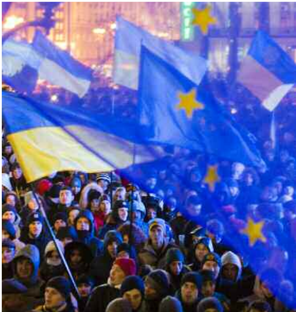
Evgeny Feldman (CC BY-SA 3.0)

This article is an edited version of a speech delivered at a CPBML public meeting in London on 20 February.