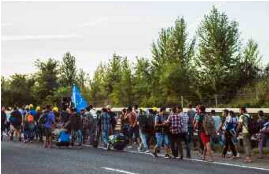
Joachim Seidler (CC BY-SS 2.0)

Refugees on the Hungarian M1 highway on their march towards the Austrian border, 4 September 2015.