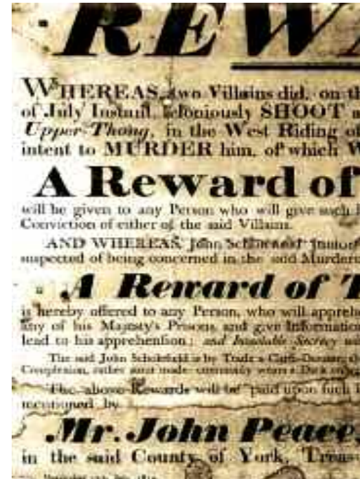
The crackdown on Luddites relied on troops, huge fines, but many were acquitted because juries felt they could not

These workers operated usually in small workshops or even from their own home. Long before the industrial revolution, property-less people – having only labour power