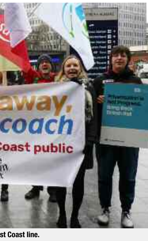
st Coast line.

pill of handing the East Coast Main Line back to the public sector to run.