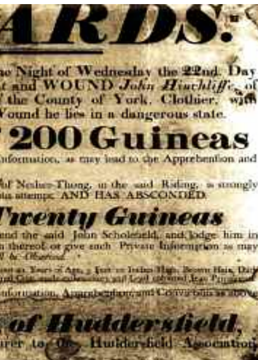
rewards and police informers. Many accused rely on the honesty of police witnesses.