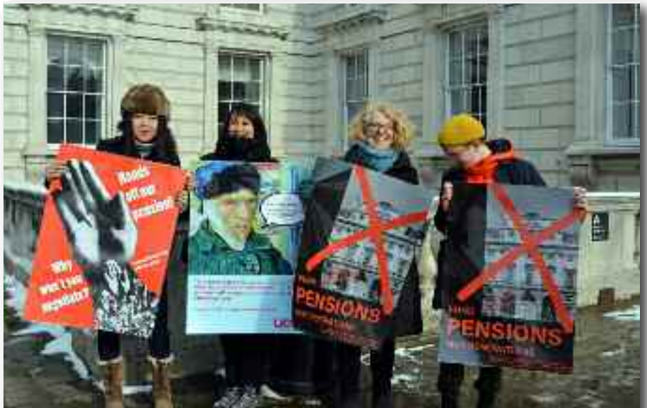
UCU members at the Courtauld Institute, London, putting their point over while on strike, 28 February.