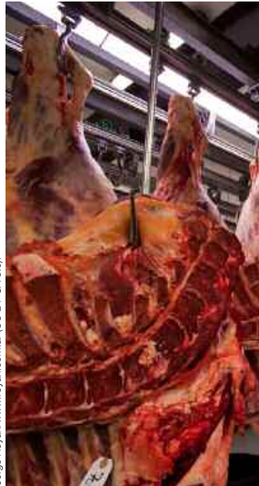
Beef carcasses in Smithfield Market, London.

In recent years the reduction in funding