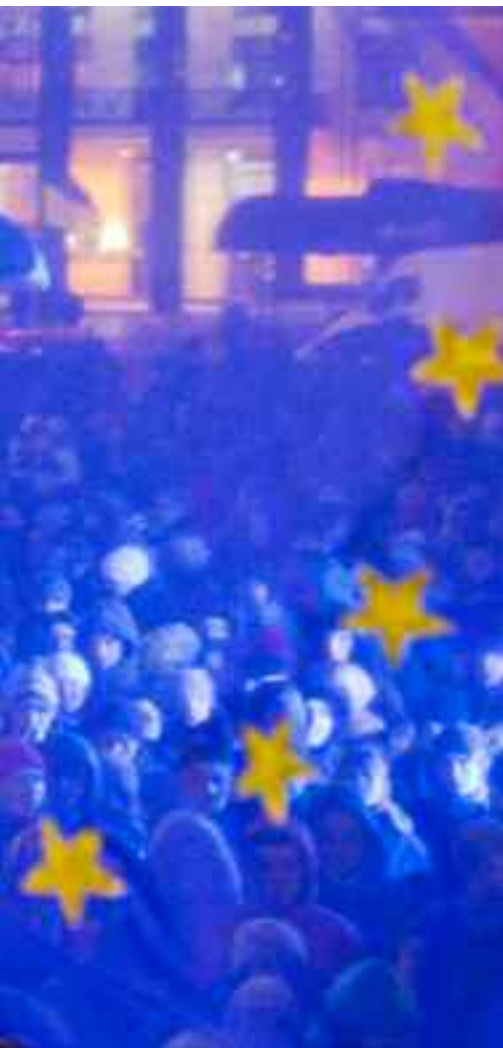
to a fascist coup.

The Agreement called for Ukraine's "ever-deeper involvement in the European security area".