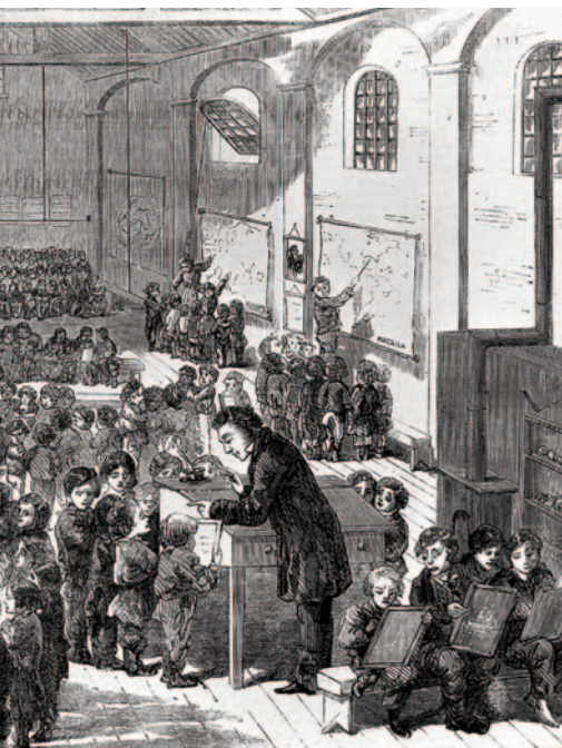
schools provided free education for destitute demand for universal education.

resolve the problem of the participation of the churches in state educational provision. But with all its flaws, it laid the first foundations of a universal system. Education was no longer a charity but a right.