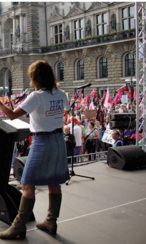
many, to demonstrate against plans for TTIP.

Partnership (TTIP) were, among others, the US corporate lobby, Business Europe, the Alliance for Responsible Commerce (ARC), and the EU Trade Commissioner.”