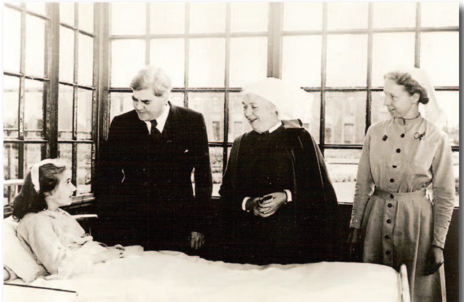
Park Hospital, Davyhulme, near Manchester, on 5 July 1948, the first day of the NHS. Good publicity for health minister Aneurin Bevan (second from left), but the true foundations of the NHS lie in a generation of questioning health workers.

How many ventilators will we have by the time this present crisis runs its course?