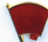
Red Flag badge, £1