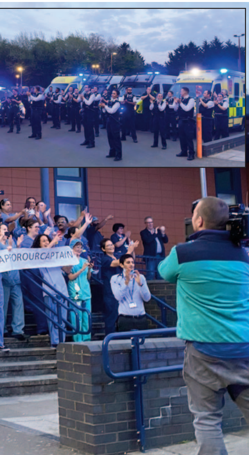
Police and ambulance workers turned out in support of the NHS (at a suitable social distance) by local residents.

professional development” (CPD) for registered nurses was slashed too.