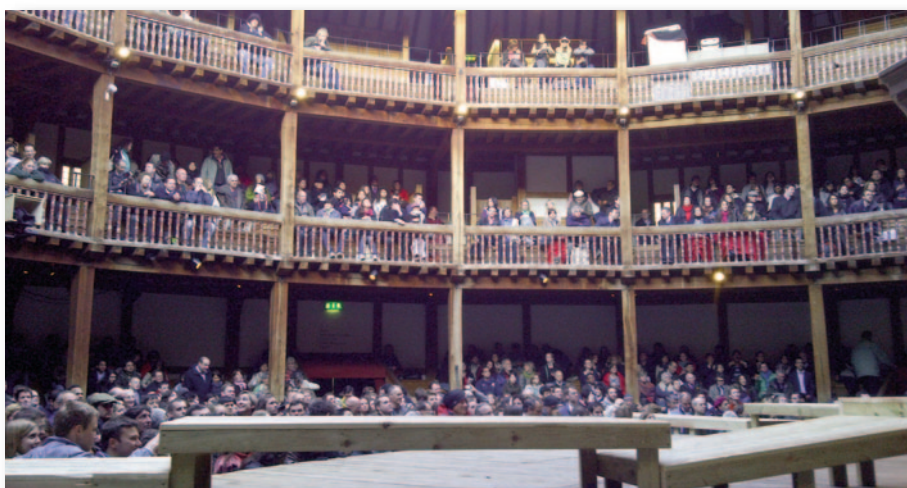
The Globe, London: currently showing premieres on YouTube.

• A longer version of this article is on the web at www.cpbml.org.uk .