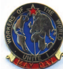
May Day badge, £2