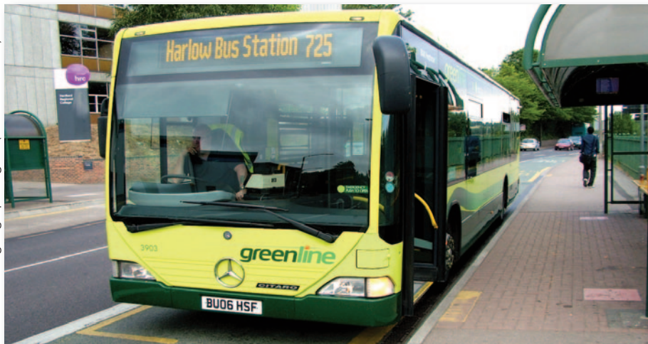
Green Line bus, run by Arriva.