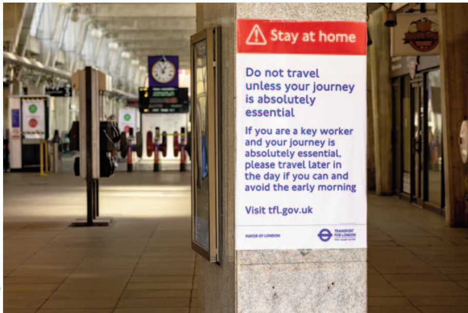
Uxbridge tube station, 12 April: a clear message.