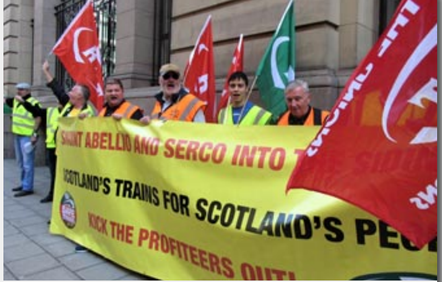
Demonstration in Glasgow, 20 September 2019, calling for ScotRail to be taken into public ownership.