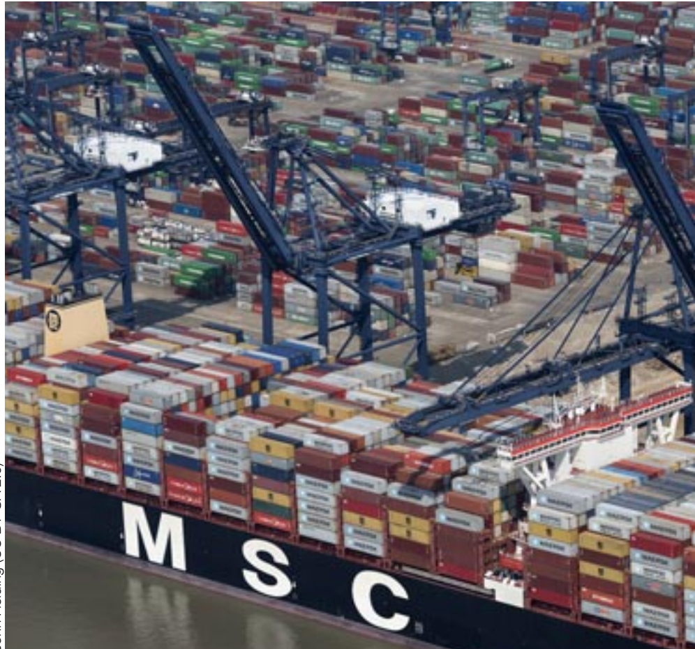
John Fielding (CC BY-SA 2.0)