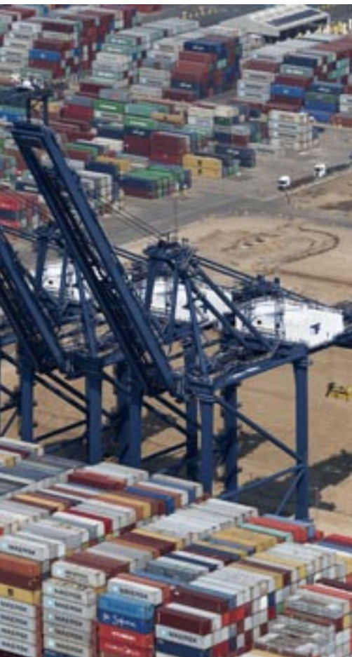
n units, equivalent to standard 20-foot containers.

million a year in a deal that adds more than £300 million to our trade imbalance, is Britain better off?