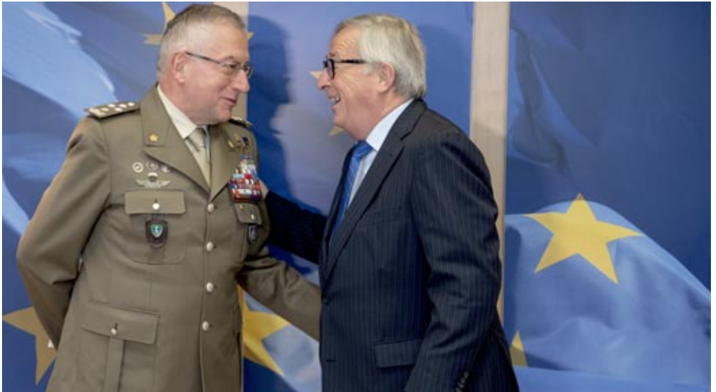
European Commission President Jean-Claude Juncker, all smiles with Claudio Graziano, Chairman of the European Union Military Committee, the EU's top military body. The UK is a member.

BORIS JOHNSON has left Theresa May's Remainer deal intact on defence matters. It would keep us in the EU through three commitments: the European Defence Agency, the European Defence Fund and the Permanent Structured Cooperation (PESCO). All bind us into the EU's Common Security and Defence Policy.