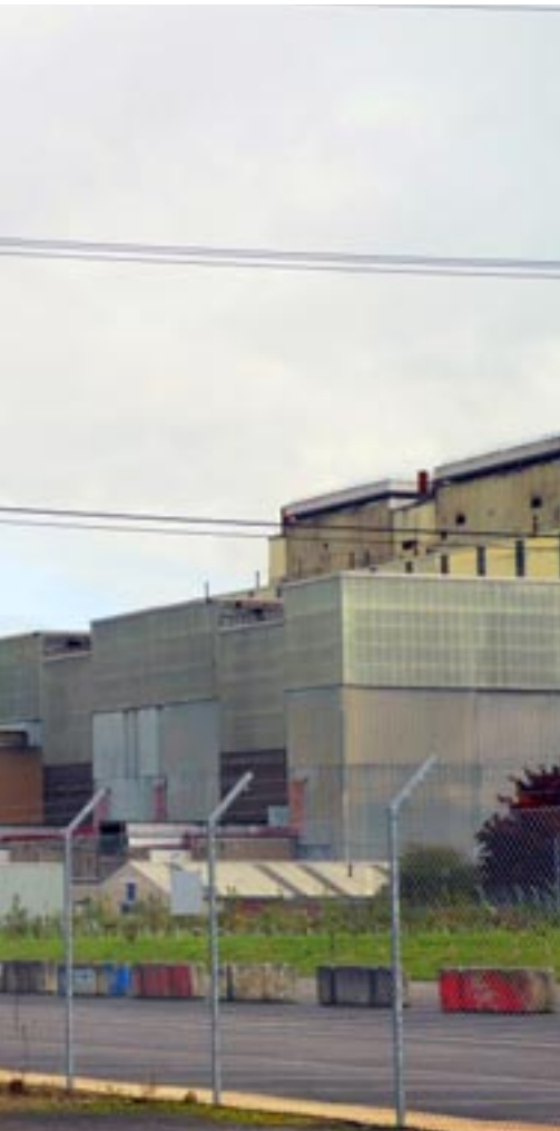
... of its previous 2 GW capacity. Photo Workers.

renewables as part of the mix in a modern energy policy, and huge strides have been taken in recent years, not least in offshore wind farms, but renewables on their own are not a silver bullet.