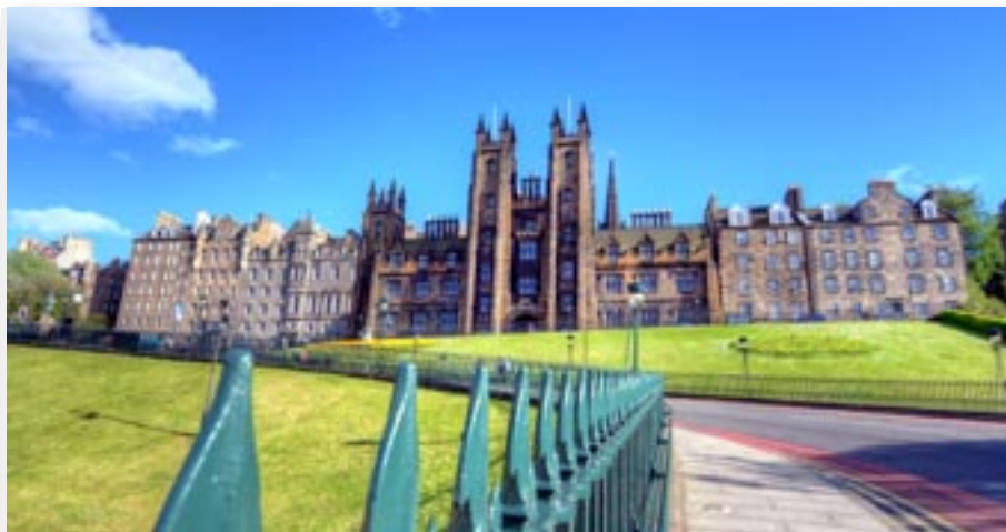
The University of Edinburgh: top of the high-earners table.

The council has a projected shortfall of £25 million for 2020/21. ■