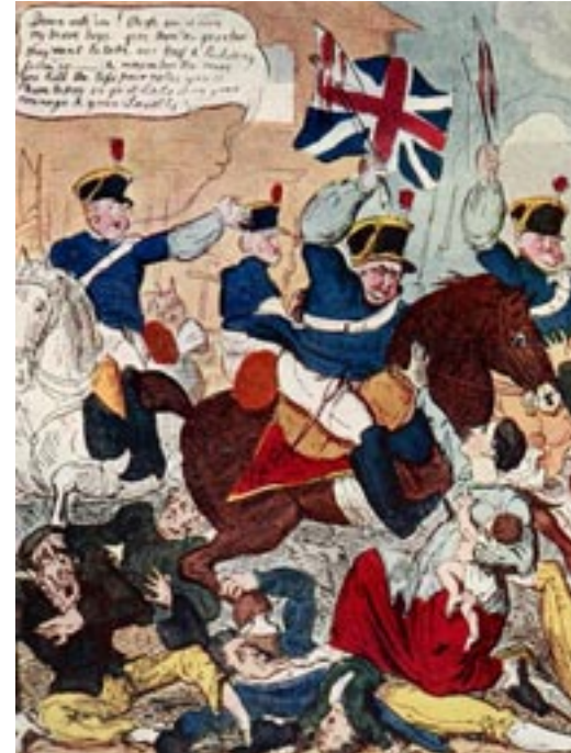
George Cruikshank's famous cartoon of the massacre. "Chop em down my brave boys: give them no quarter! --- & remember the more you kill the less your courage & your Loyalty."

Within 20 minutes the field was empty save for bodies and the discarded debris of the rally. The troops rallied in front of the magistrates' building and gave three cheers. Later the Prince Regent sent a message commending their "preservation of the public tranquillity". The chief magistrate William