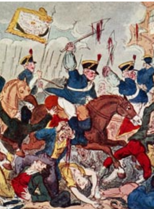
...ssacre. The speech text reads: "Down with 'em! ...rter they want to take our Beef & Pudding from ...oor rates you'll have to pay so go at it Lads show

gave the magistrates the power to search private houses, and to confiscate weapons, (5) restricted still further the right to hold a public meeting, and (6) subjected the periodical pamphlets published by the radicals to the newspaper tax, with the object of preventing cheap publications.