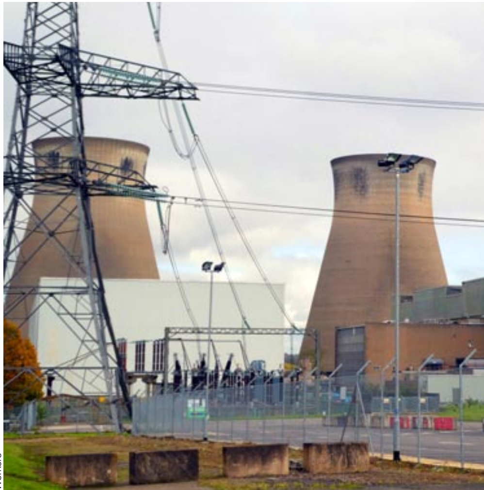
A shadow of its former self: Ferrybridge now produces a mere 68 MW of power, less than 5 per cent of its former capacity.

'For the foreseeable future renewables will not be enough.'