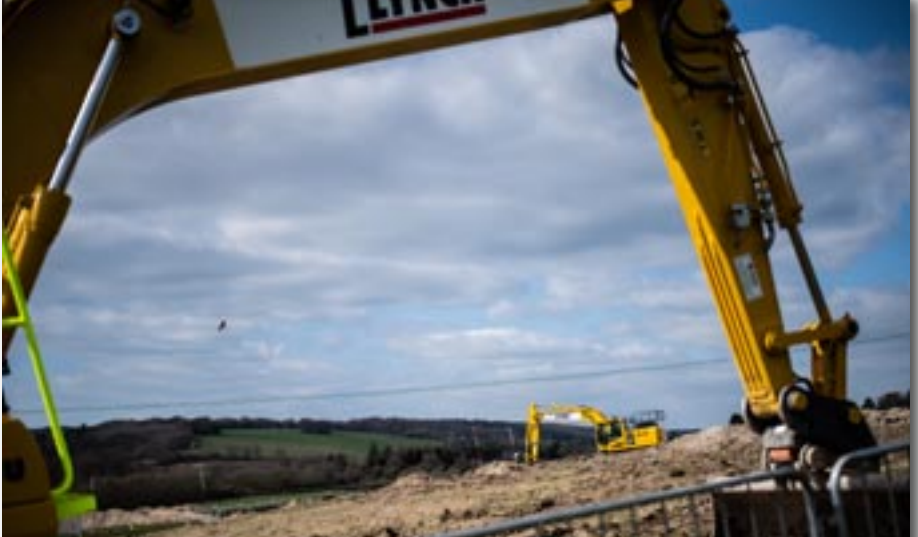
HS2 construction work, Great Missenden, Buckinghamshire.