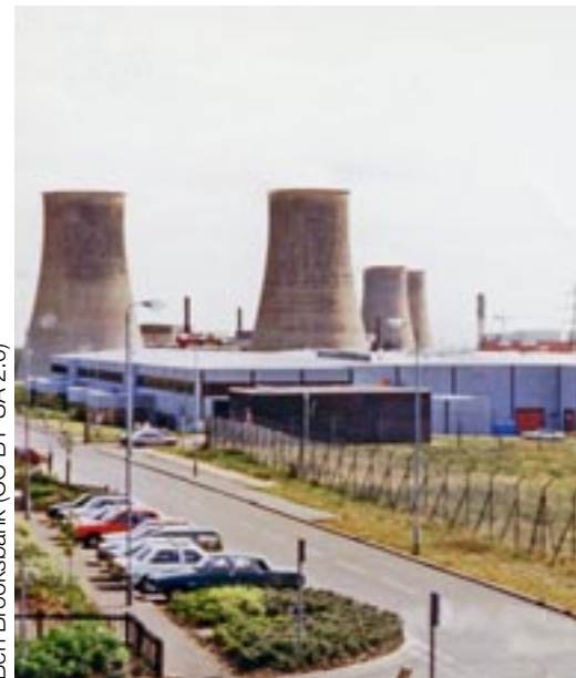
The Sellafield Nuclear Plant in 1986 with, left, the

‘US non-cooperation meant that Britain had to develop its own nuclear technology...’