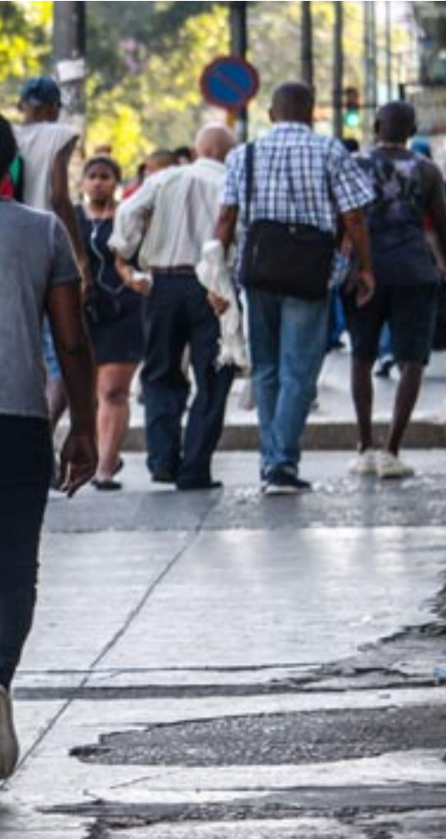
part of Cuba's track and trace strategy.

has increased the regime of sanctions to ramp up the pressure on the Cuban economy.