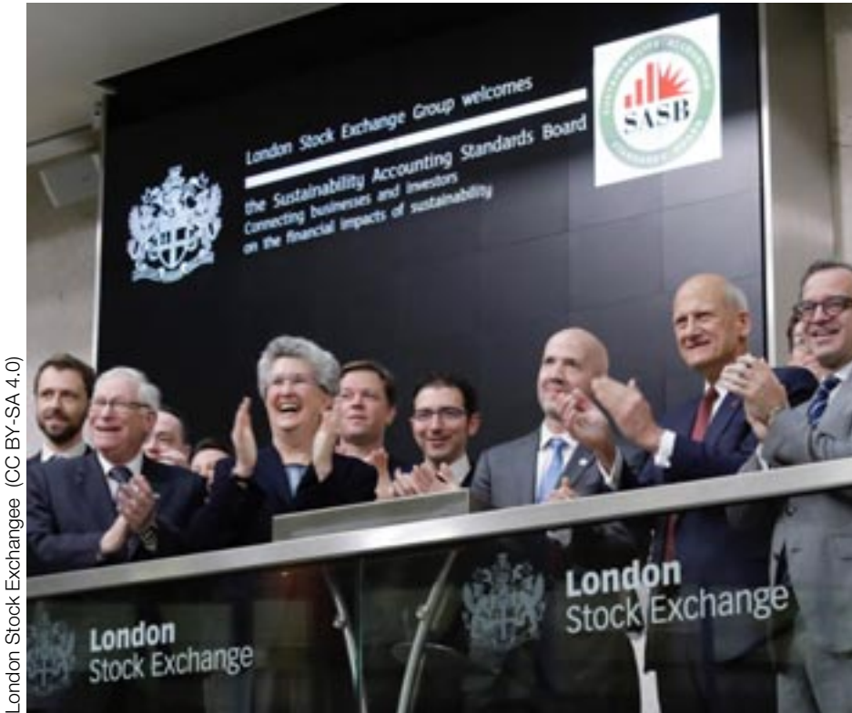
London Stock Exchange (CC BY-SA 4.0)

All very pleased with themselves. But it's we who are paying the price.