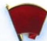
Red Flag badge, £1