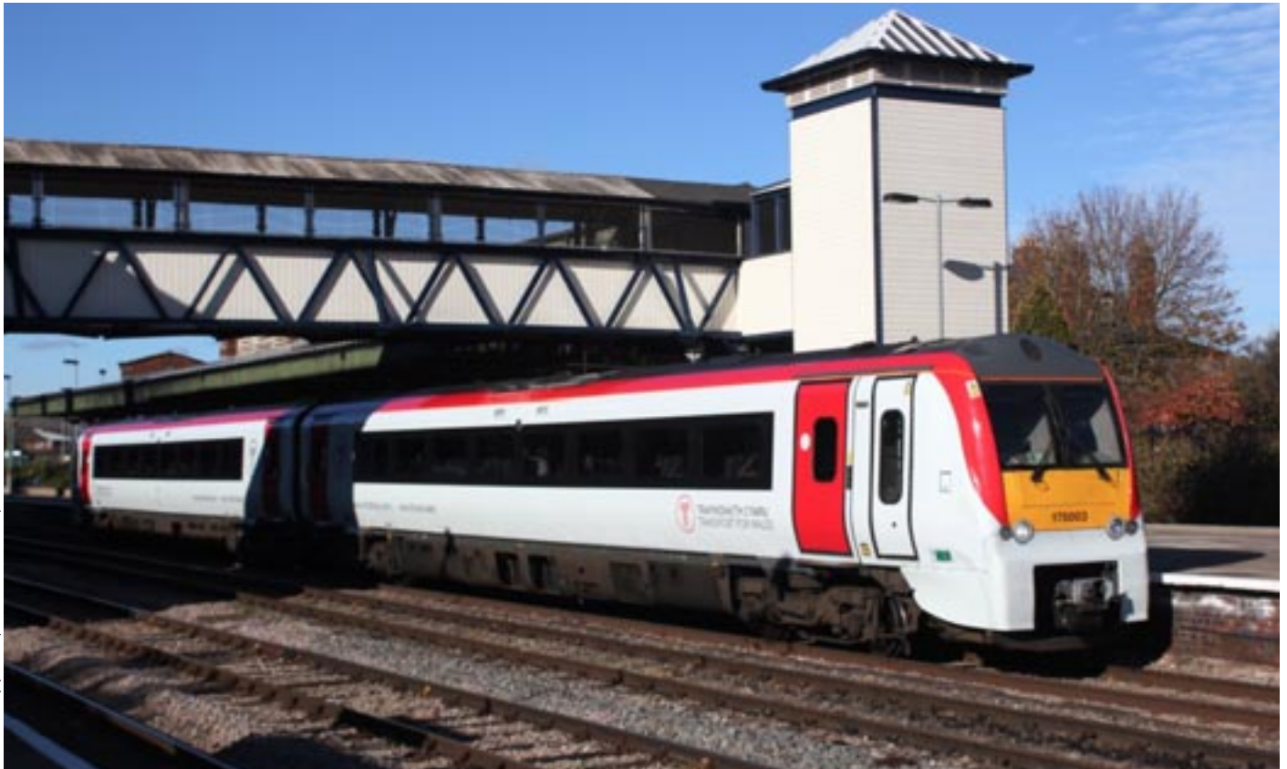
Transport for Wales service to Carmarthen pulling away from a call at Hereford.