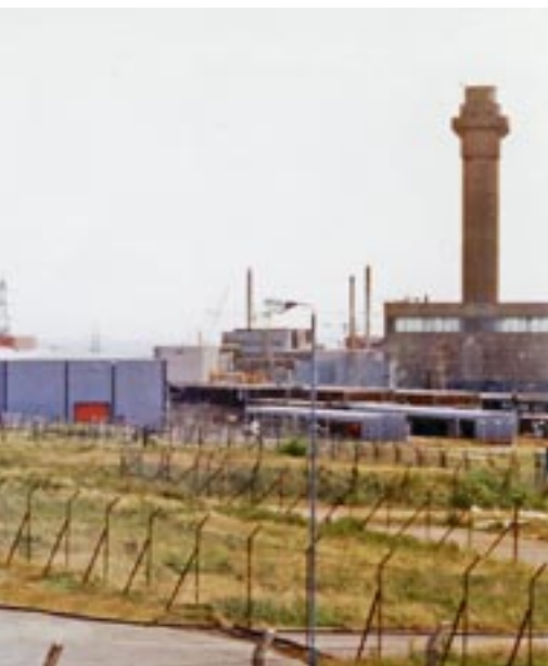
the cooling towers of Calder Hall Power Station.

disastrous decision. The AGRs were built late, hugely over budget and never performed at the level they were designed for. By now the USA was marketing water-cooled reactors, which were technologically in the lead and cheaper to build.