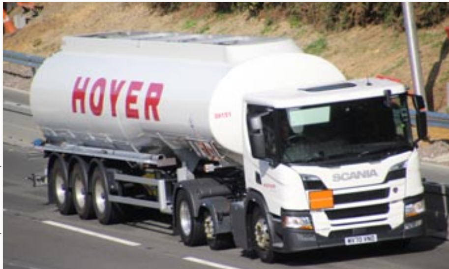
EDDIE (CC BY-SA 2.0)