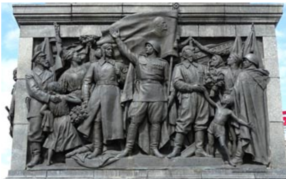
Second World War memorial in the Belarus capital Minsk recalls more progressive times.

'Leading supporters of the main opposition candidate were heard praising Hitler...'