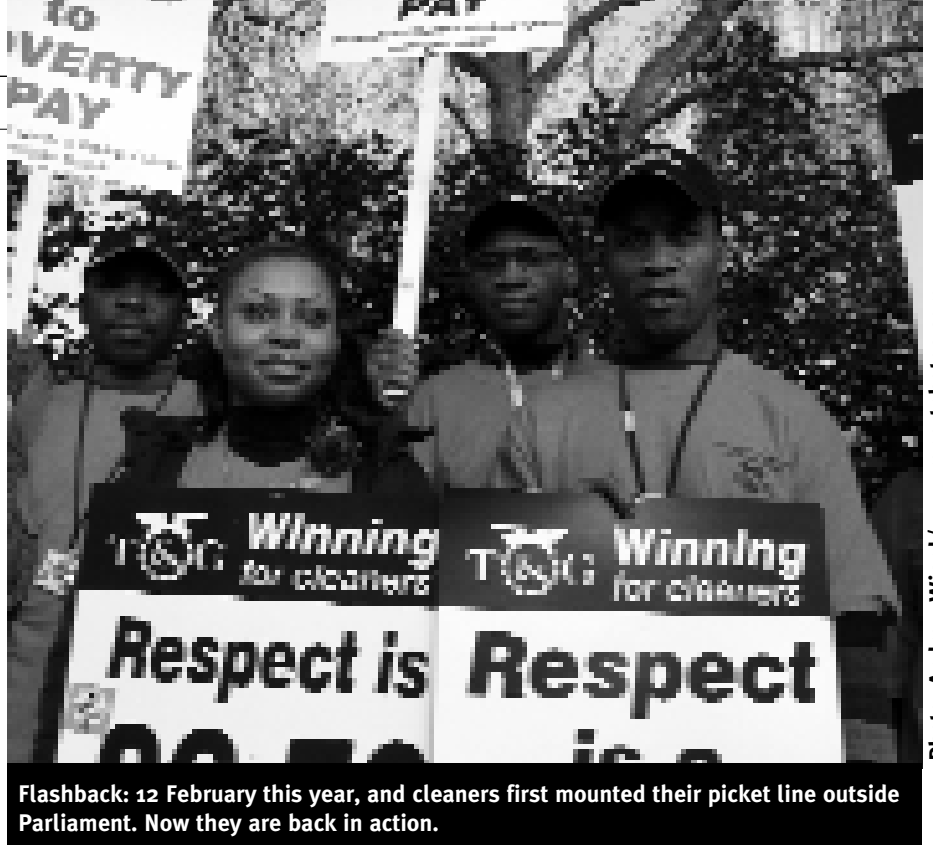
Flashback: 12 February this year, and cleaners first mounted their picket line outside Parliament. Now they are back in action.

Electoral loser Gerhard Schroeder, the ousted German Chancellor, speaking at a Europa Forum meeting in Strasbourg, said that the European Constitution "is certainly not perfect, but it is a very good compromise which can and will move Europe forward decisively. This magnificent project - and I am not embarrassed to use this word - cannot be abandoned."