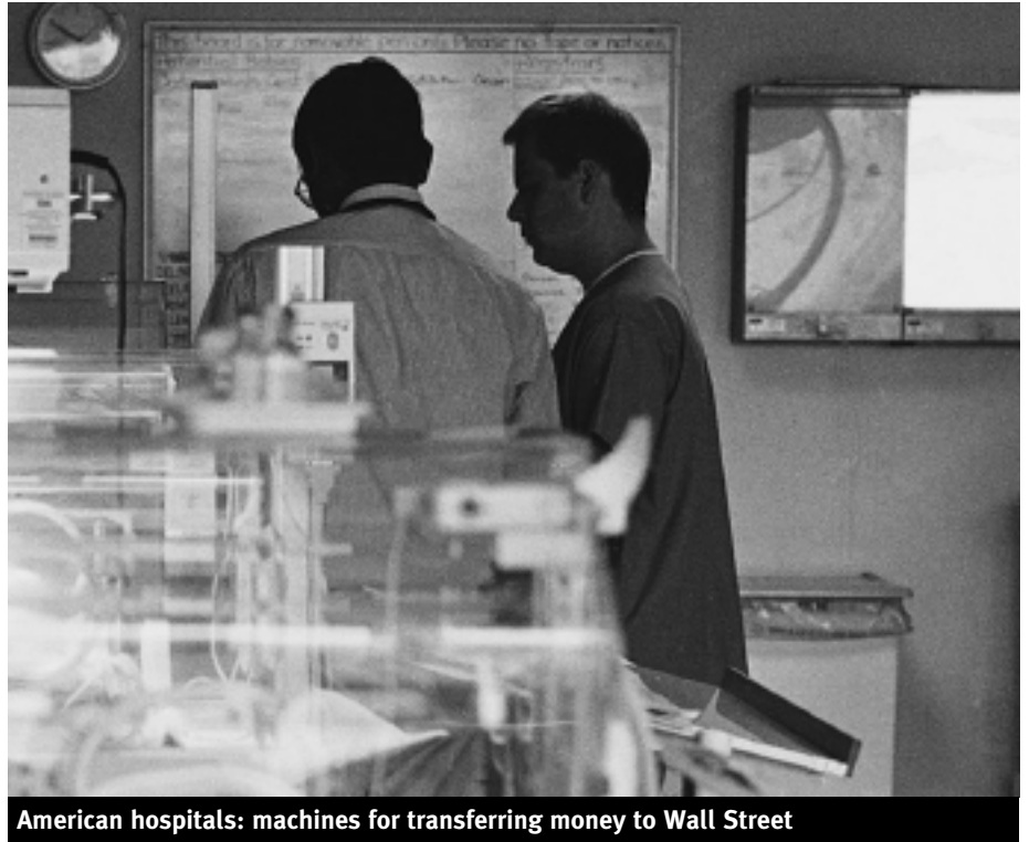
American hospitals: machines for transferring money to Wall Street

Those who can least afford to pay are charged the most. The uninsured and underinsured pay five to ten times as much for health care as the insured. Those who can't pay are sued, have their wages stopped and hold car boot sales to pay their medical costs. Families are left with debts that would take a lifetime to pay off. One hundred million Americans, those with loopholes and exclusions in their insurance coverage, are underinsured.