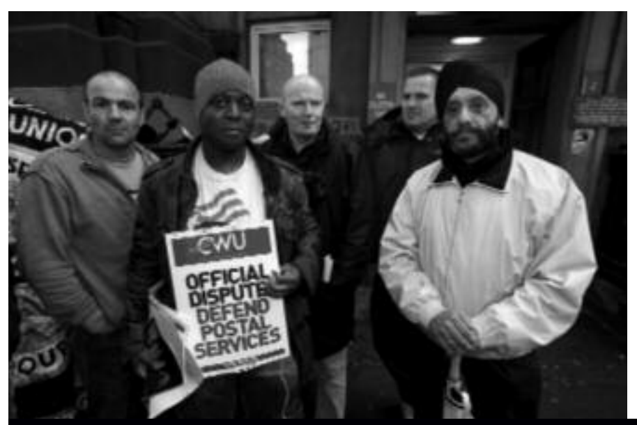
Postal workers on the picket line during their strike – the first national strike in over a decade – over pay and jobs

BROWN could not risk losing a November election a few weeks after the EU agreed the Treaty, with the Tories committed to a referendum. The ruling class wants Parliament to ratify the Treaty by March 2008. The Treaty would have been ratified for 18 months by the time of a general election in 2009: by then they hope it will be a done deal.