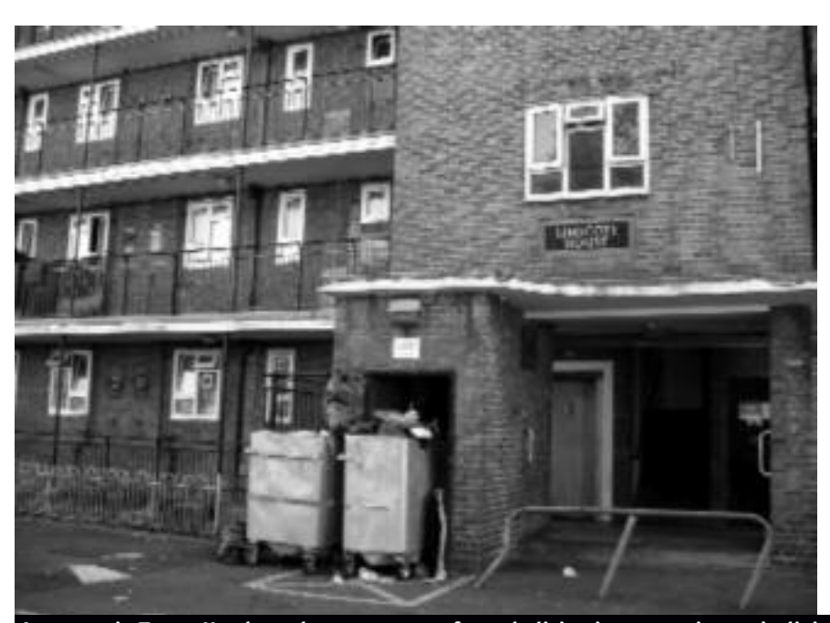
An estate in Tower Hamlets: the percentage of people living in poverty is not declining in the central London boroughs, where 48 per cent live in poor households.