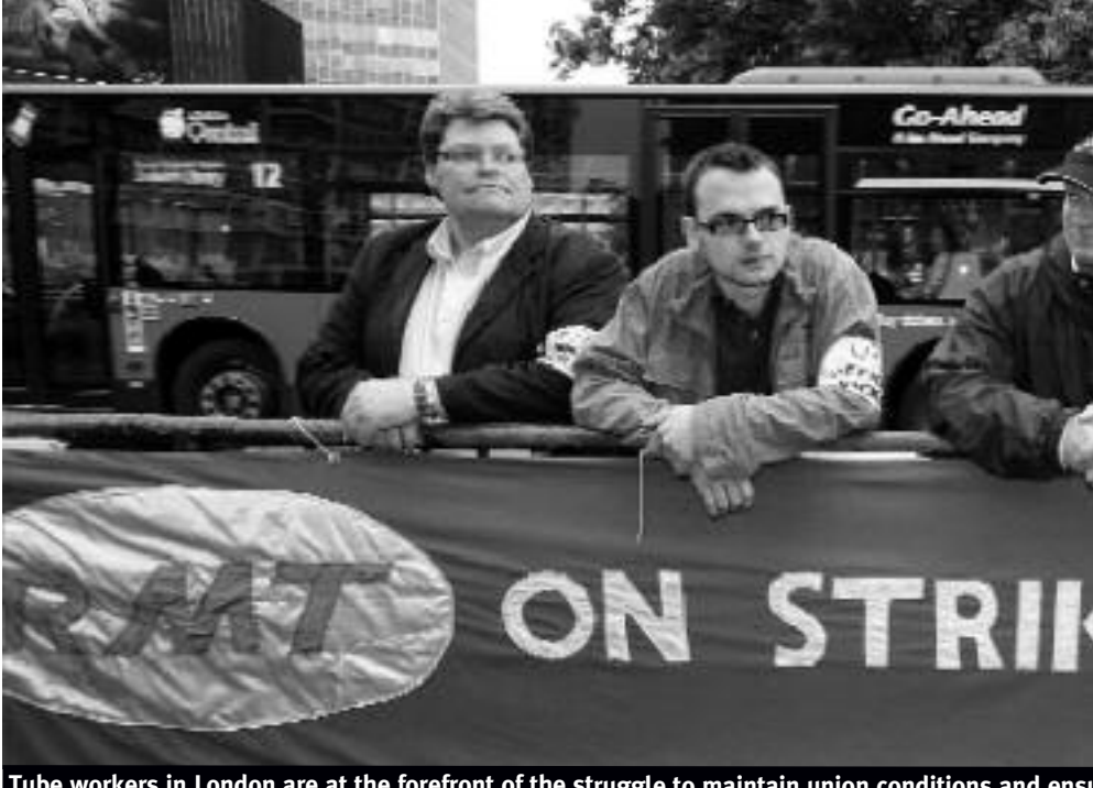
Tube workers in London are at the forefront of the struggle to maintain union conditions and ensi

In a separate action, two 24-hour strikes by Alstom-Metro tube maintenance workers over pay and conditions resulted in an offer now being