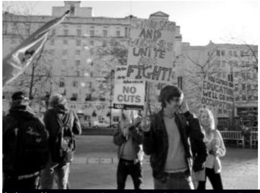
Students and lecturers were out demonstrating in Leeds City Square on 20 October.

will have the world's dearest public degrees, with families having to pay between £76,000 and £136,000 to put two children through university. The UCU calculates that a three-year degree with annual tuition fees of £6,000 would cost £38,286, including maintenance loans and interest payments. A three-year degree with annual tuition fees of £12,000 would cost £68,329, including maintenance loans and interest payments.