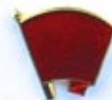
Red Flag badge, £1