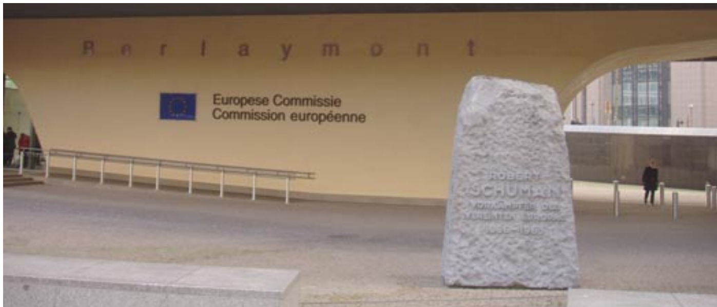
Headquarters of the European Commission in Brussels.