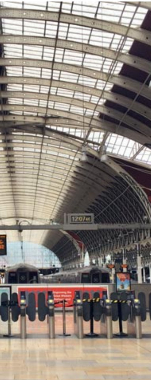
King's Cross Station during the rail strike on 30 July.

the use of agency staff to break strikes.