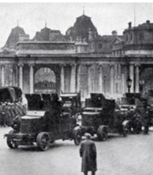
the General Strike.

The TUC General Council called off the strike on 12 May. It had obtained no terms for the miners or for the other workers who had struck in sympathy with them. The miners continued on strike alone for six months and eventually were forced back to work on regional settlements, longer hours and lower wages, with an ever-present pool of unemployed miners to undermine their efforts.